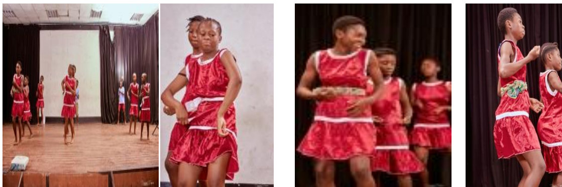
The Baleh dance

After the sketch the Handicap centre continue with a ballet dance. Eventhough some could not hear but they were able to dance accordingly. They had the strength, were able to cooperate, understand and made it a day with us at the cultural centre.