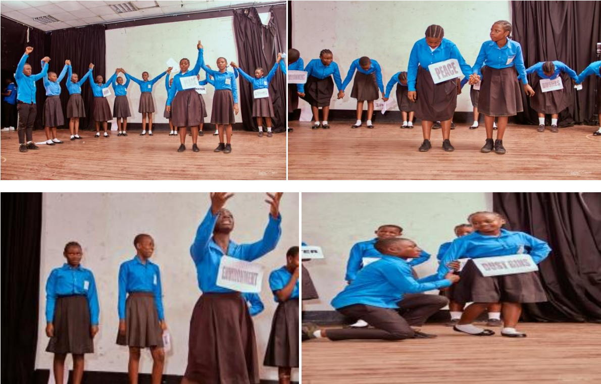
A sketch on environmental values

After the handicap centre, the GHAC students came up with a sketch on “peace” and the environment. During this act the students were able to bring out the different values which if all are expressed there will be peace, and the different elements of the environment which if well taken care of, there will be good health, avoidance of floats, landslide, littering, dirty gutters, potholes, dustbins etc. Some of the values they highlighted through the sketch were peace, love, care for the environment, the rivers and oceans, respect, Responsibility, simplicity, humility, Tolerance, Unity and Cooperation. They also reflected on natural elements and disaster such as water and floats, Hills and Landslides, bushes, trees, potholes and dustbins breeding mosquitoes etc. They related all these to the hazards happening around our different environment. In their conclusion they made us to understand that if all these climate change issues are taken into consideration, and are taken care of, we are going to live a peaceful life in safety and be free from diseases.