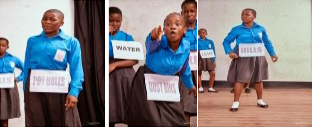
Presenting elements of the Environment