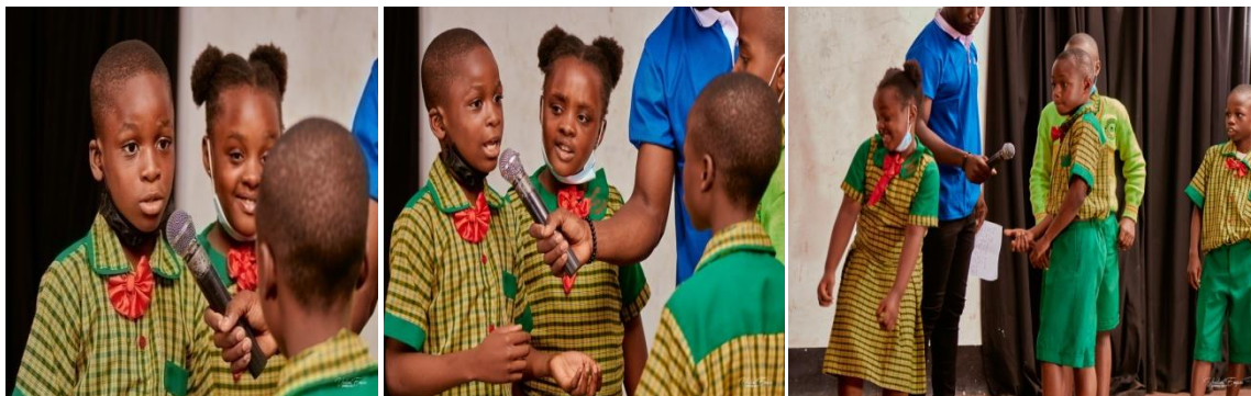
Bostel pupils acting a sketch on littering of the Environment

The Pupils of green hills academic complex came up with a typical traditional instrumental dance. The young men with their traditional instrument were able to play the instrumentals without offering a word, and the dancers were able to understand the music of the instruments and danced accordingly. We saw the young dancers excising alot of strength, understanding, cooperation, humility, simplicity etc. The dancers also came in with peace; the plant they carry signifies peace. It is called the peace plant. From their dressing you can see the way they have beautify themselves in the traditional way so as to be loved, expressing happiness, oneness and solidarity.