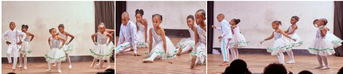
The baleh dance from Bostel

Bostel School came up with a baleh dance during which the children presented very wonderful skills. Some of the values we identify in their dance were cooperation, strength, happiness, freedom etc. The Bostel children also presented a sketch on environmental littering, during which they demonstrated how important it is for everyone to be responsible in keeping the environment clean. Showing how important it is for us to learn how to uphold our environmental values.