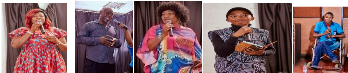
Min social affairs

We had some reactions from some of the invitees from the Ministries and other associations.