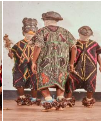
The JUJU dance done by AMASIA Students