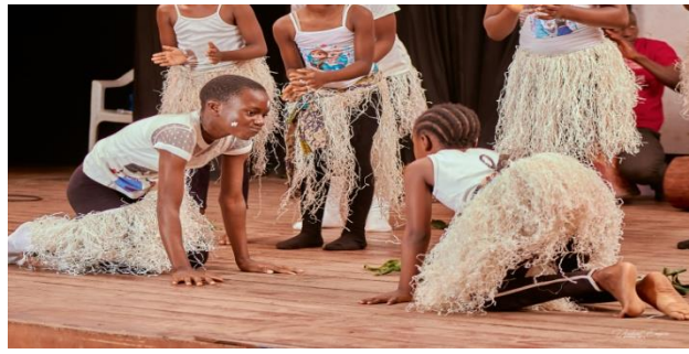
They dance, passing on their message through the different styles

The pupils of green hills academic complex came up again to express how they live their values through different professions such as a teacher, a nurse, a doctor , a journalist etc.