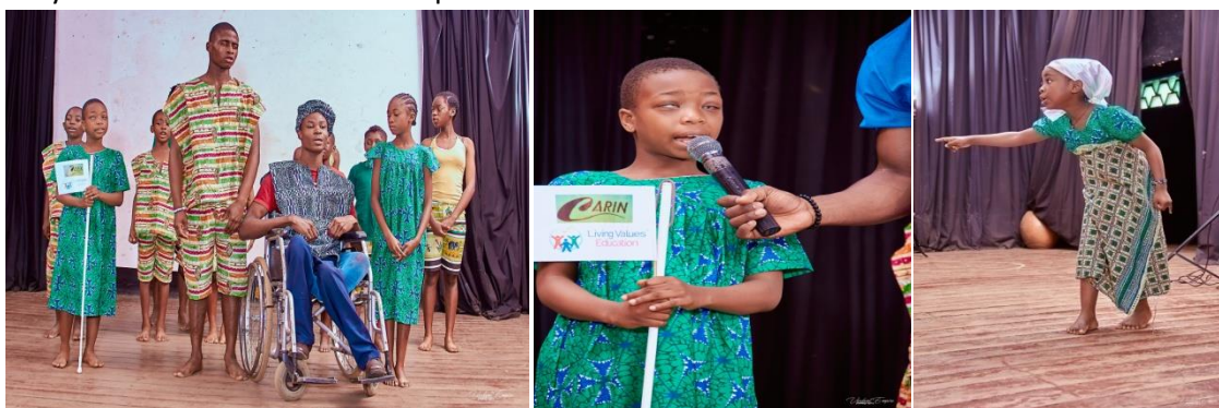
A sketch presented by the Handicap children [je ne suis pas handicapper]

We continued with a presentation of a sketch by the children from the handicap centre titled “Je ne suis pas handicap”. During this sketch the lame and the dumb and deaf children were not left out. They did their best to make their presence to be felt.