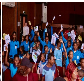
The Children greeting the President of ALIVE International by waving their Values flags